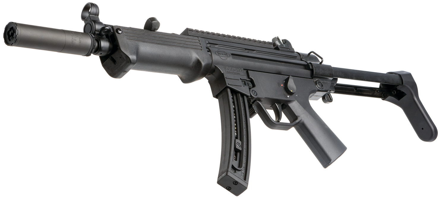
.22 SLINGSHOT -Ti