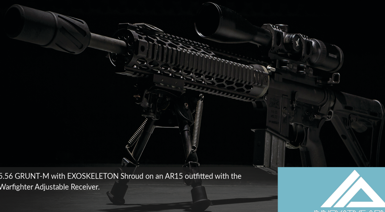
5.56 GRUNT-M with EXOSKELETON Shroud on an AR15 outfitted with the Warfighter Adjustable Receiver.