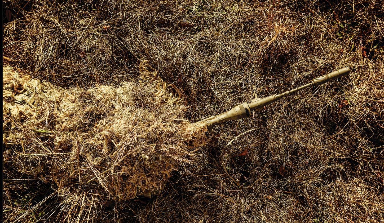
7.62 Long Distance Service Provider (L.D.S.P.) with EXOSKELETON Shroud on M1A