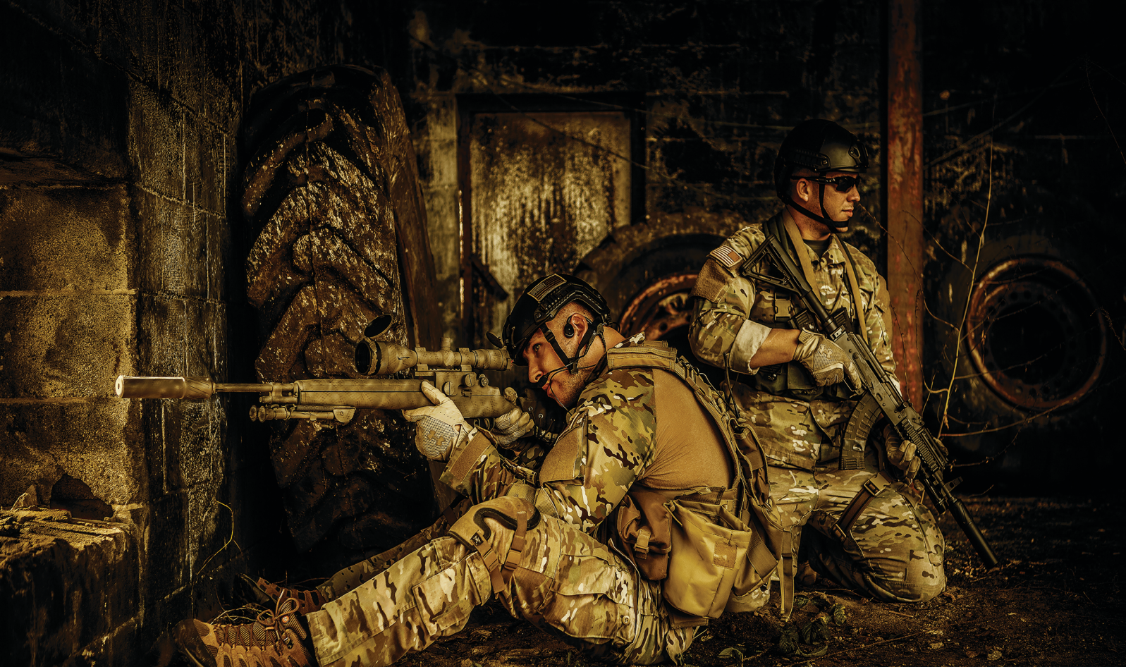
7.62 Long Distance Service Provider (L.D.S.P.) with EXOSKELETON Shroud on M1A 7.62 DECEPTION on SBR AK47