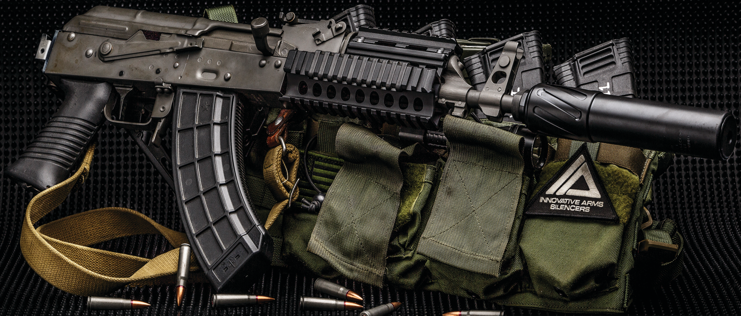
7.62 DECEPTION with EXOSKELETON Shroud on custom build short barreled AK47