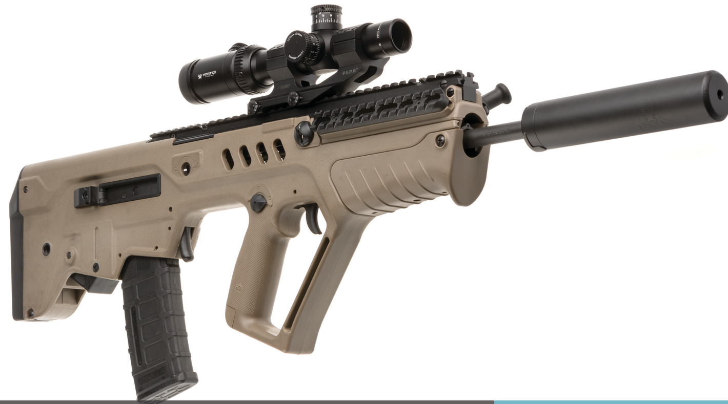
5.56 INTERCEPTOR quick attach