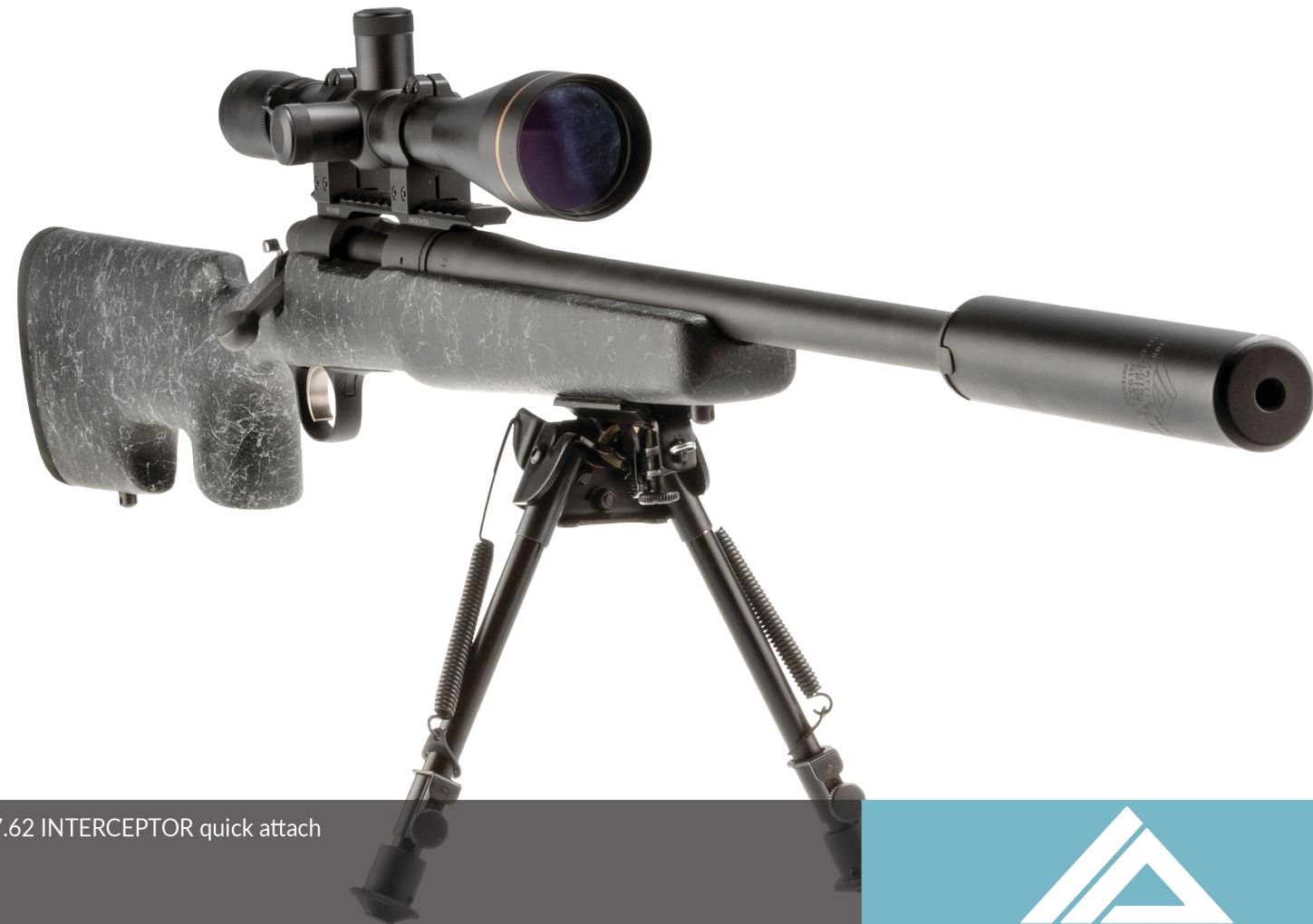
7.62 INTERCEPTOR quick attach