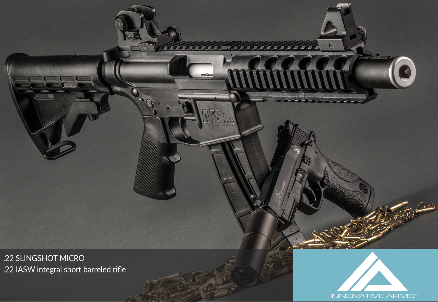
.22 SLINGSHOT MICRO .22 IASW integral short barreled rifle